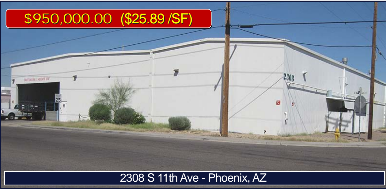
2308 S 11th Ave - Phoenix, AZ